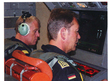
Operators ponder the details....

on 23 May 2004, almost a month after the Dutch parliament decided on disbanding the Maritime Patrol Group and the proposed sale of the thirteen aircraft.