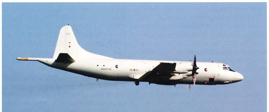
Newly aquired P-3 Orion shows her colours