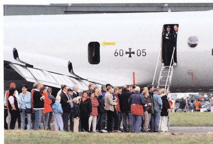
The new P-3s are introduced to the public at Nordholz Air Day, August 2006.

replacement of almost all mission equipment, including the central computer system and the work stations onboard the aircraft. This enables the crew to produce a complete situation picture involving all the aircraft's sensors, at every individual work station. They even have the option to send this and other data to land based command centres or to commanders in the field. Only ten of the thirteen Dutch Orions went through the CUP, three of which received the wiring for all systems but were fitted with a limited equipment suite and were meant to conduct mainly coast guard missions. One of these three aircraft was sold to Germany and the other two ended up in Portugal. During the CUP, the original AN/APS-115 radar was replaced by the more modern AN/APS-137B(V)5 radar with Synthetic Aperture and imaging capability (SAR/ISAR). Radar systems like this can not only provide a location for a target, but it can also give the radar operator a good picture of the target's profile. Other important improvements were the installation of a completely new acoustic processor and sonobuoy receiver (AN/ASQ-78B), and a new Internal Communication System (AN/AIC-34). Furthermore, all aircraft