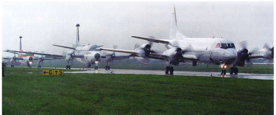
P-3 and two Atlantics prior to take-off

the proposed brand new Lockheed Martin P-7A (late 80s) and an MPA derivative of the Airbus A-320 commercial jet to modified second hand P-3 Orion airframes (between 1995 and 2003). The last serious program to replace the Atlantic was a joint German/Italian program. Both countries