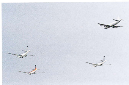
Three Atlantics and a new P-3.

Forty-eight RNLN personnel (11 flight crew and the rest technical staff) will assist the German Navy at NAS Nordholz until the summer of 2007. More German crews will get their training at Nordholz. And No.1 Squadron is looking forward to taking part in Exercise Noble Manta '07 at NAS Sigonella in April with a P-3C CUP. Also, the squadron is planning on doing a