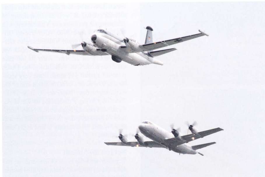
P-3 and Atlantic flypast on an overcast day at Nordholz Air Days.

October 2006. The OFT is planned to be ready in the summer of 2007. A year later it will be moved again: to Nordholz this time.